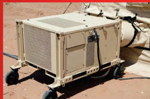
ALASKA 2.5-TON ECU