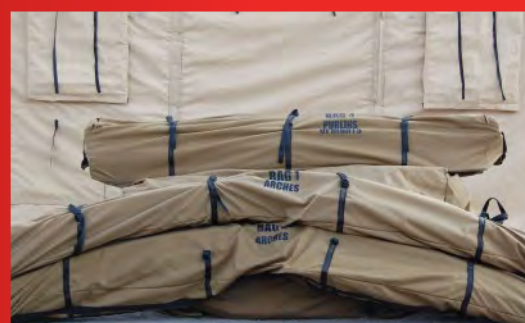
CARRY BAG SYSTEM